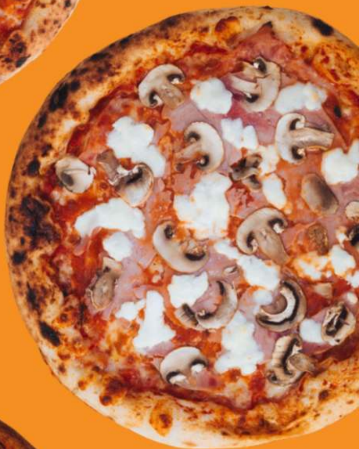
EL CLASICO 10,90€

San Marzano, mozzarella, olive oil, basil (1,7)